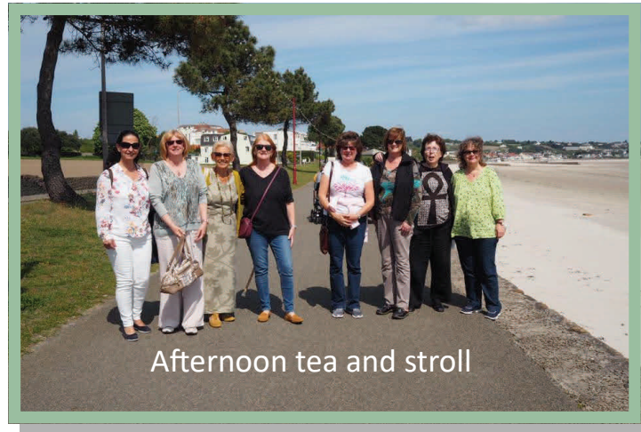
Afternoon tea and stroll